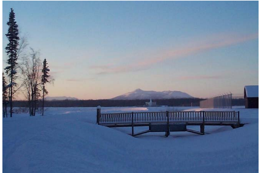
Takotna Mountain viewed from McGrath on a cold morning