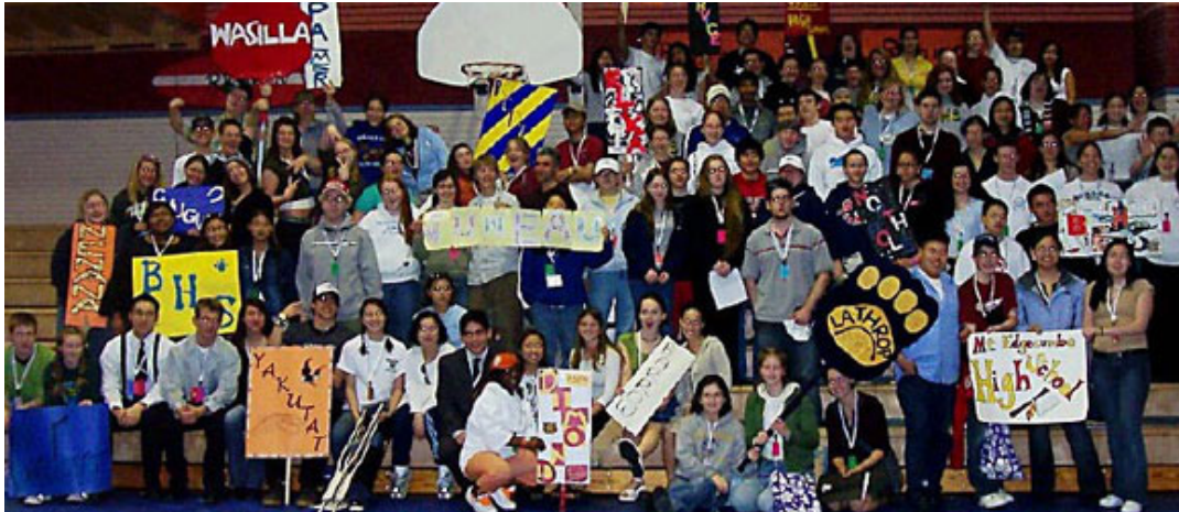
Some of the participants from High Schools across the state.

The main focus of this conference was the 24 submitted Resolutions that were all actively discussed, debated and then voted on by all participating schools. Discussions were broken down into Regions and we were in Region 1, the smallest out of 7. All active involvement is from the students, run by students and implemented by students.